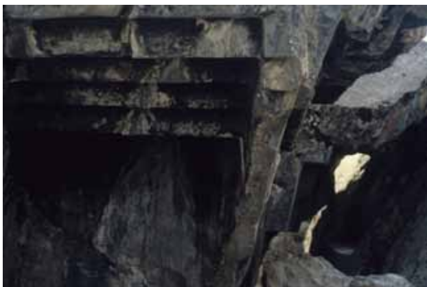
Figure 9: Example of stepping in rock from the Saqsawaman area, Cusco.