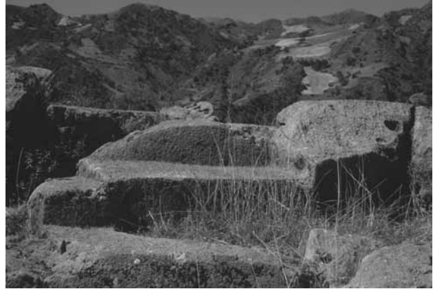
Figure 6: Rock Outcrop Pumauroú with carvings.