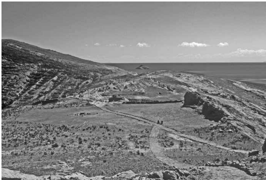
Figure 5: Rock Sanctuary on the Island of the Sun, Lake Titicaca, Bolivia.