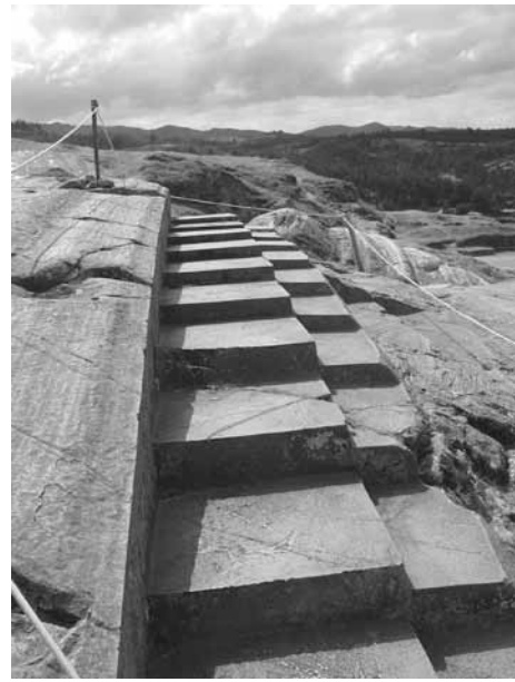
Figure 2: Example of carved rock in the geometric style from the Saqsawaman area, Cusco.