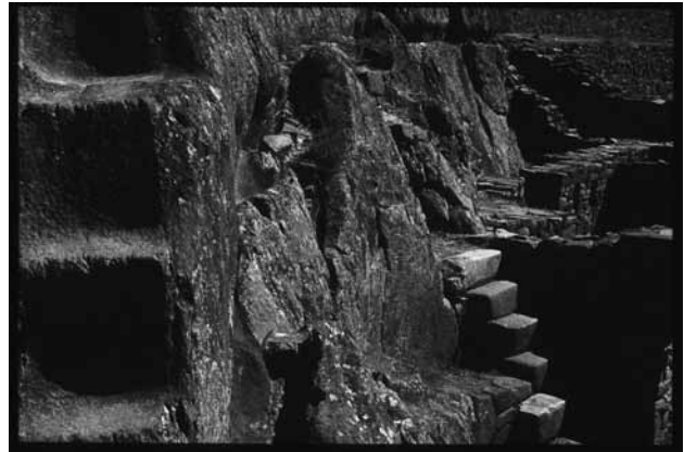
Figure 8: Ollantaytambo, Inkamisana sector.