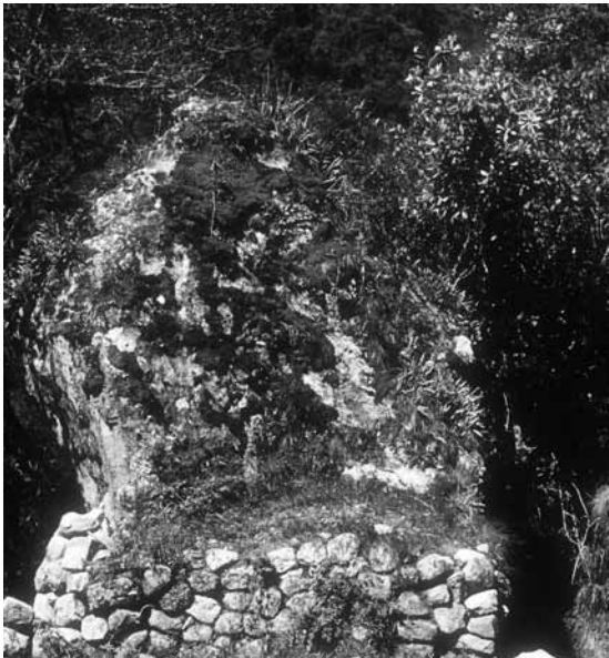
Figure 7: Unmodified stone wak'a in Wina Wayna.