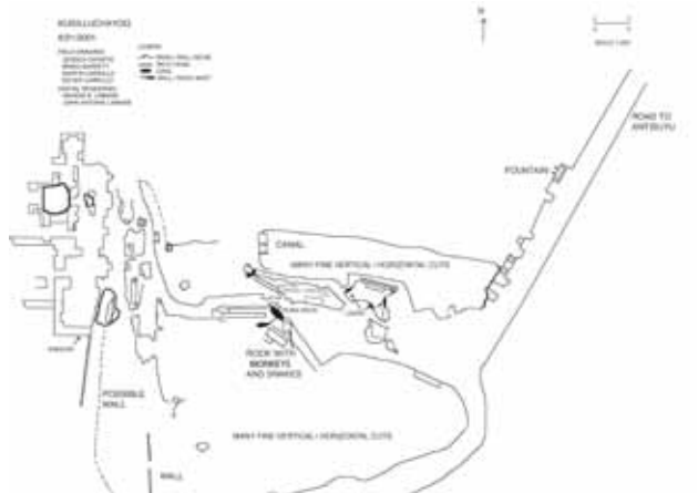
Figure 10: Kusilluchayoq with road to Antisuyu, plan. Field drawing by Jessica Christie; digital rendering by M. and J. Labadie.