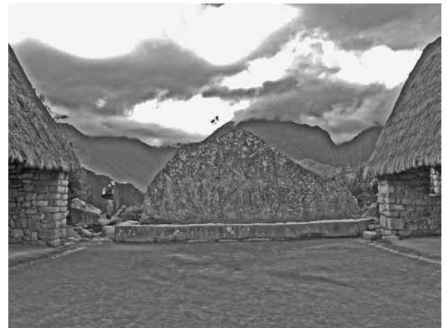
Figure 4: Machu Picchu, Sacred Rock copying distant mountain in the northeastern sector.