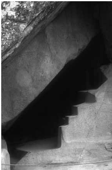
Figure 3: Machu Picchu, Cave formation below the Temple of the Sun.